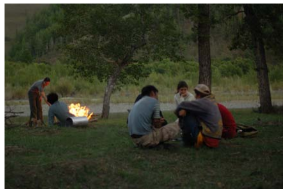
To build a fire , 2008, C-print and diasec, 50 x 76 cm (5ex + 2AF).