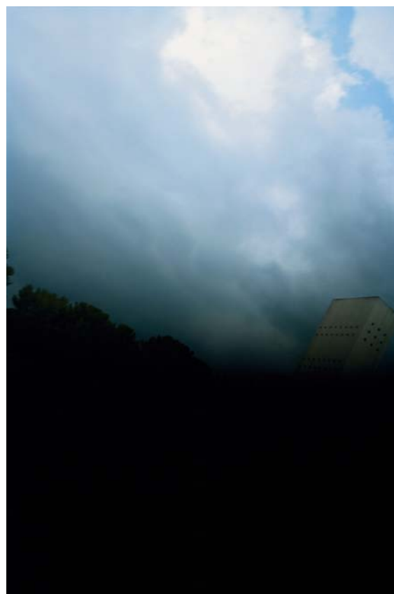
Montperrin , 2008, C-print and diasec, 100 x 66 cm (5ex + 2AF).

Suburbia, people queueing in airports, landscapes, construction sites... Most images speak, tell stories. Their noise cannot be turned down. They obliterate the silent signification of their objects but Pétreil's images achieve to get rid of everything that interferes with and cover up the manifestation of silent evidence. They filter the impact of the subject and facilitate the deployment of the objects's own magic. The object is never anything more than an imaginary line. The world is an object that is both imminent and ungraspable. How far is the world? How does one obtain a clearer focus point? Is photography a mirror which briefly captures this imaginary line of the world? Or is it man who, blinded by the enlarged reflection of his own consciousness, falsifies visual perspectives and blurs